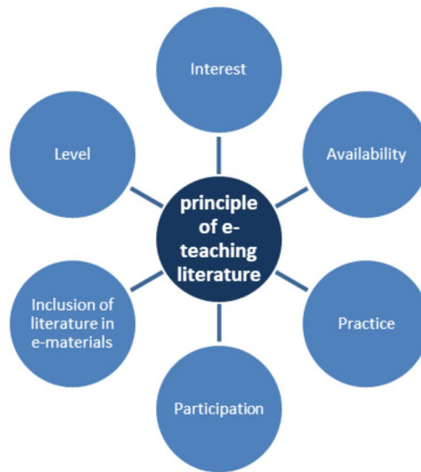
Fig. 1 Principles of e-teaching Literature

herself does not enjoy literature online can never effectively teach it online either. The principle of interest is necessary for all fields of literature.