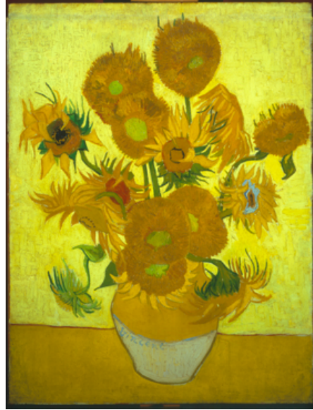
FIG. 5. The recovered images for the van Gogh painting f458.