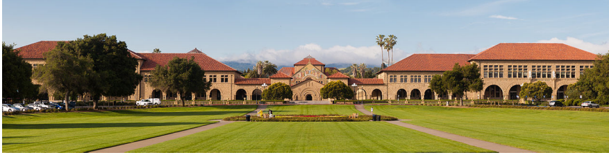
FIG. 4. The recovered images for the stanford image.