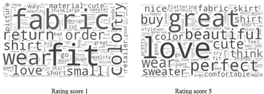
Fig. 2 Word cloud overview for reviews with scores 1 and 5

by scholars including translations [17, 37, 38], question answering [39], synonym replacement [16], etc. The present study adopted one of the recent methods introduced in [39], that is, Easy Data Augmentation (EDA) comprising four NLP operations, namely random deletion, random insertion, random swap, and synonym replacement (see Table 2 for explanation and examples). EDA is known for its simplicity and ease of use as it does not require any predefined datasets, and often yield promising results [17, 36, 40]. For instance, Xiang and peers [40] compared various data augmentation techniques on several datasets and found EDA to perform better than DICT (i.e., a synonym replacement thesaurus [41]) but was outperformed by their proposed POS-based augmentation technique. The present study adopted the default setting recommended for EDA by [36], that is, up to four augmented sentences were generated for each original sentence using a learning rate of 0.1. We administered all four operations listed in Table 2 on each sentence, hence generating