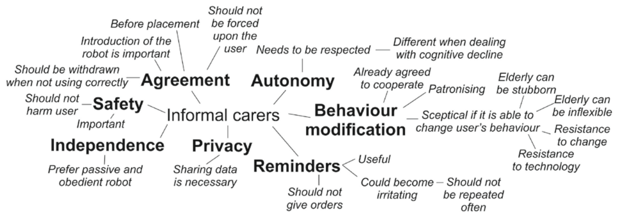
Figure 2: Overview of the different topics (in bold) that were discussed during the informal carers' focus group sessions.