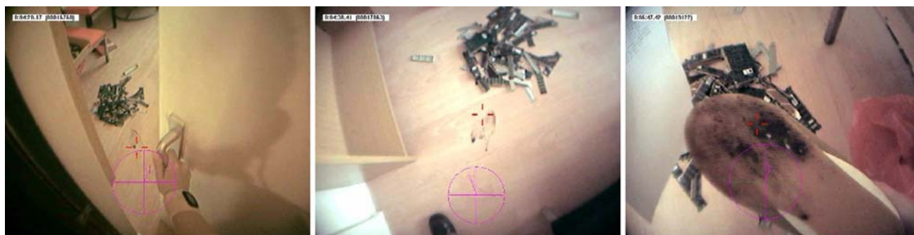
Fig. 2 Series of images from eye-tracking worn by experienced CSE inspecting a ransacked office

immediately noticing a black mark on the floor (a), closer inspection indicates that this is a footwear mark (b) and, during the course of subsequent searching a plastic bag is found under a table and a pair of shoes found in the bag—the shoes have a black substance on their sole and the tread looks similar to that in the footwear mark (c). The scene had been staged to look as if an opportunistic thief had broken into the office and stolen money from a petty-cash tin (which was left open on top of the desk). However, in a twist in the scenario, we had staged the scene to actually reflect an ‘insurance job’, that is, the office’s owner had staged the crime to claim on his insurance for loss of cash, personal possessions and some computing equipment.