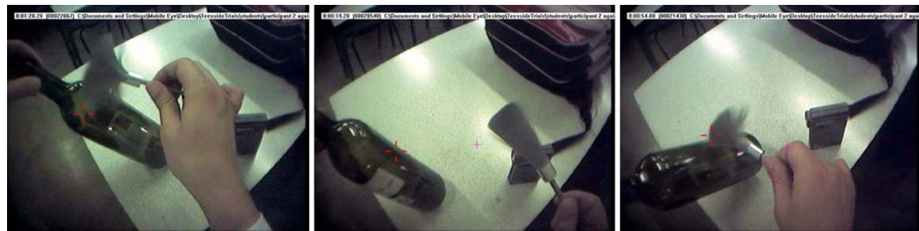
Fig. 3 Dusting for fingerprints

during the visual check phase. Concurrent verbal protocol during the search suggested that the CSE initially concentrated on two areas that were anticipated to reveal marks—and there was an assumption that each area would reveal different types of mark. Around the neck of the bottle, the search was initially for marks from fingertips and thumb holding the bottle vertically (as if carrying it) and around the middle of the bottle the search was for marks of the bottle resting across the middle of the fingers and being controlled by the thumb. Thus, a schema of how the bottle could have been used influenced the initial search.