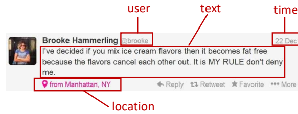
Fig. 1 Geo-tagged Tweet

Time attribute. In some cases, geo-textual objects have a time attribute. The time attribute is often a time point (e.g., 10:05:20 a.m., 30-MAY-2019), capturing the time when the real-world object represented by the geo-textual object was at the indicated location or the time when the object was created. The literature uses terms such as spatio-temporal document or spatio-temporal message for such objects. Common examples include geo-tagged tweets from Twitter (Fig. 1), check-ins at particular Points of Interest, and location reports by individuals who move about. Time attributes may also include time periods (e.g., opening hours: 10:00 a.m. to 9:00 p.m., weekdays).