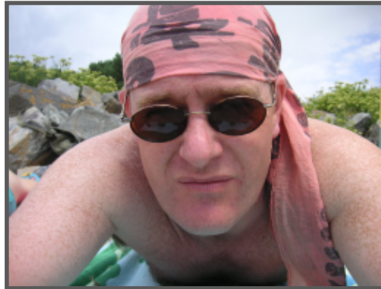
Figure 8. A photo remembered for what happened to the subject shortly after the photo was taken