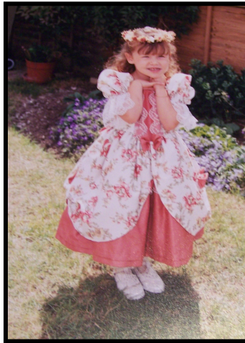
Figure 5. A young woman looks back on her old hair colour