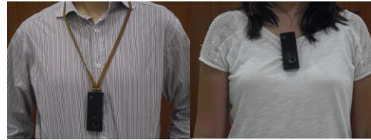
Fig. 1 Autographer camera worn around the neck (left) Clipped on (right)

We employed a camera-based method to gain an understanding of food consumption habits and motivations for buying fruits and vegetables. We investigated this using wearable first person perspective camera – the Autographer [1], the world's first commercial wearable camera. These wearable cameras can be clipped to clothing or worn around the neck (see Fig. 1) and passively take still images every 10–30 seconds (depending on sensor values). We next describe the camera-based method that we employed.