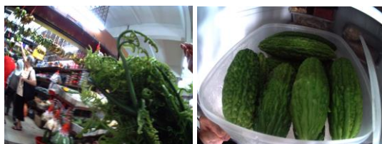
Fig. 5 A local, traditional vegetable fern bought from a shop (left) Bitter gourd for juicing (right)

Other examples showed that the small number of participants who did consume certain produce (such as bitter gourd) on a weekly basis, did so because of their knowledge of how to prepare it in a way that tasted nice.