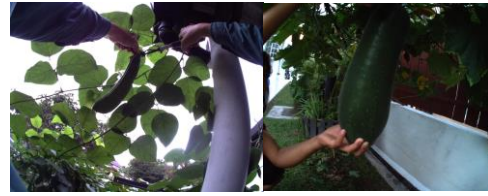
Fig. 3 Examples of lesser-known vegetables grown in participants' gardens - sword beans (left) and winter melon (right)

As well as buying food, participants in both countries made use of gardens or wild plants for food. Seven out of ten participants in Malaysia grew some of their own food either in the garden or indoors (see Fig. 3). Participant M10 attended a permaculture on sustainable living course and subsequently had planted many varieties of lesser-known crops in her garden such as sword beans in support of local, tropical crops. The Malay participants would often plant 'ulam' (herb salad of Malaysia) vegetables in their own garden or in their home villages.