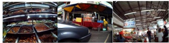
Fig. 4 Examples of food outlets in Malaysia serving local, traditional food – a Malay restaurant (left), a street vendor selling “rojak”, a local fruit salad mixed with prawn paste (middle), a bitter melon noodle food stall (right).

In Malaysia, a number of participants used food waste to feed plants. This sustainable food practice was often learnt from older relatives or word of mouth: “ Anything that left over my mum also will do that, like yogurt and milk ” (M7).