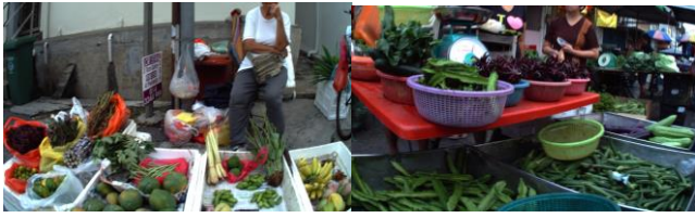
Fig. 2 Market sellers selling local, traditional produce