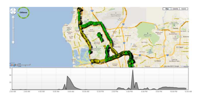
Figure 3. Personalized map page with miAQI plotted by location. Users can click a balloon to learn more detailed information. The graph displays samples plotted by time of day. In this case you can see the user's commute to and from work as the two peak exposure times. Our maps are implemented as an overlay on the publicly available Google Maps framework [9].

The webpage and Android application both support sharing through the Facebook and Twitter social networks. This integration allowed users to post air quality data directly to their social networks with a single click.