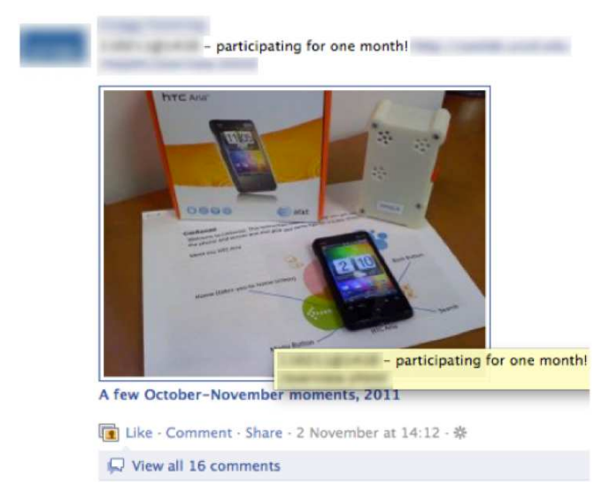
Figure 5. Unprompted introductory post created by one participant. By introducing his online community to the CitiSense project, he better prepared them for understanding and responding to his subsequent air quality posts.

Figure 4. Example of a CitiSense post shared on Facebook. The URL links to the live map page showing the points from the time window that the participant decided to share.