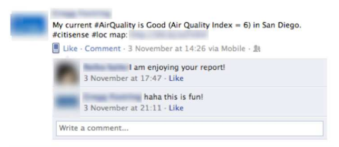
Figure 4. Example of a CitiSense post shared on Facebook. The URL links to the live map page showing the points from the time window that the participant decided to share.

For 33TnBsM, who shared his commute – and thus his air – with his fellow passengers, it was natural to share with them the data he was collecting. Together they were able to reason about the readings they observed, drawing correlations between spans of bad readings and the possible bad air sources near the train.