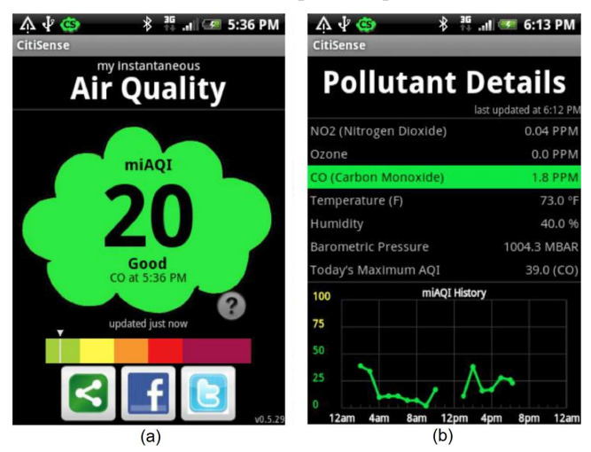
Figure 2. (a) Application home screen. Cloud color and number change based on current sensor readings. The bar at the bottom indicates where on the spectrum the current reading lies. (b) Pollutant details screen. The graph displays peak readings by hour.

The miAQI number and color is displayed prominently on the mobile application home screen (Figure 2) and is also used to populate and color the balloons on each participant's personalized map page (Figure 3).