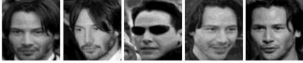
(d) Example images from the LFW database