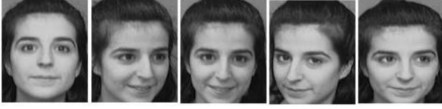
(c) Example images from the ORL database