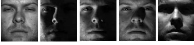
(a) Example images from the Extended Yale B database