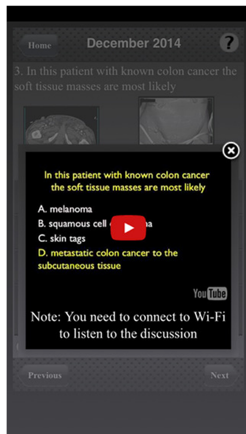
Fig. 2 Discussion