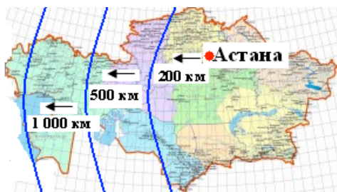
Fig. 1. Organization of video conferencing with ungraded schools of the Republic of Kazakhstan

Using the module Conference Moderator provided performing video conferencing sessions via the Web-based interface with ungraded schools. The scheme of video conferencing with ungraded schools of the Republic of Kazakhstan is as follows: