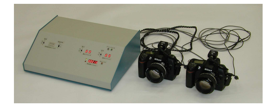
Fig. 1 Photo of our imaging system composed of two cameras and an electronic controller

scribed in \S2 . An example of the PIV is described in \S3 . The remarks are summarized in \S4 .