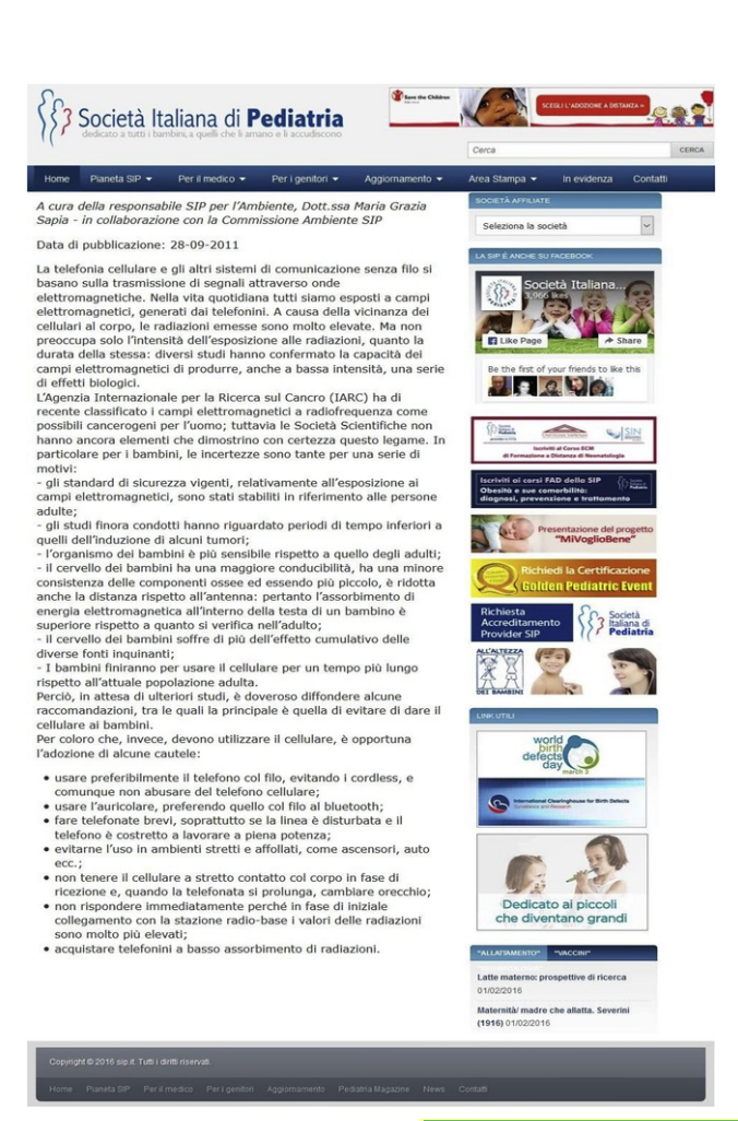
Fig. 1 Screenshot of one of the websites used. (Figure 1 should not appear here. The right place is in the Method section (see where I included the citation to this figure).)