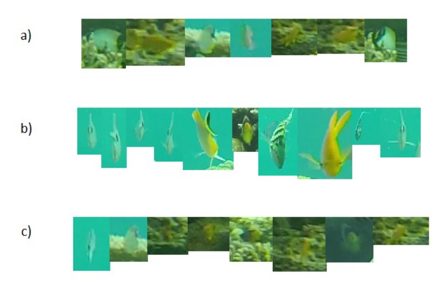
Figure 2: Samples of thumbnails recognized by the CNN model and not recognized by humans (a), samples of thumbnails recognized by humans and not recognized by the CNN model (b) and sample of thumbnails misidentified by both humans and the CNN model (c).

The success rate of the best model is similar to that of the model of Siddiqui et al. (2016) which reached a success rate of 94.3% on 16 species. This latter model was trained on a much smaller training dataset of 1309 thumbnails than our model (> 900 000 thumbnails). However, Siddiqui's model was designed to identify fish on videos recorded in partially controlled conditions (i.e. fish swimming close to a baited camera) while in our case we tested the ability of the model to identify fish partially hidden by corals as well as shot in all positions and orientations. The few misidentifications by our best model mostly occurred when only the face or back of fish was visible. Such an issue could be easily circumvented in practice when analyzing videos because it is likely that each fish will be seen from the side on at least one frame (out of the 25 frames recorded per second by most cameras).