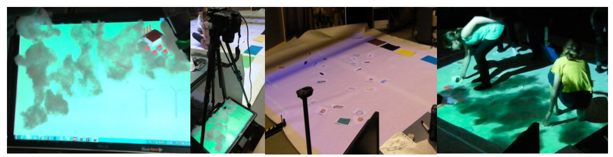
Figure 06: Left: Mixed-fidelity approach using Wizard of Oz prototyping. A camera recorded the prototype during the manipulation process. Centre: The camera was connected to a projector projecting the final image on the floor. Right: Paper sheets with different kinds of waste were spread out over the playground (picture right).

programming language Processing . For instance, each time a child "grew a vegetable" by interacting with the floor in a specific location, the design expert who was manipulating the mechanics of the projection created a virtual tomato in the same place. The design expert also controlled the velocity of the windmills according to the children's physical actions. The other part of the interactive experience was directly manipulated using physical objects. For instance, to simulate pollution, we used cotton balls that one designer manipulated in real-time on a computer screen (Figure 6, picture 1). These actions were recorded by a camera that was connected to a video projector (Figure 6, picture 2). The final image was projected on the floor (Figure 6, picture 4). The recycling task consisted of sorting physical paper sheets with different kinds of waste that was spread out over the game floor (Figure 7, picture 3).