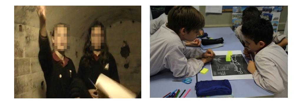
Figure 3. Left: A group explaining its interest in the medical room in the shelter). Right: A group brainstorming ideas for the redesign of the guided visit.

Building on our experiences in this project, we recommend employing design techniques in the first design stages that allow researching both children's worldviews on the educational context and the appropriateness of the interaction concept that designers envision. In this project, the definition of the context was led by the design and field experts. Nevertheless, depending on the project requirements, it is also likely that children will be involved in the decision-making process of this aspect. Finally, we conclude that the technique is applicable to other research contexts related to the design of child experiences and site-specific locations. The activity helped to overcome different levels of children's verbal expression because they could include visual clues and body language. This allowed the co-designers to assess children's contributions on a multimodal level.