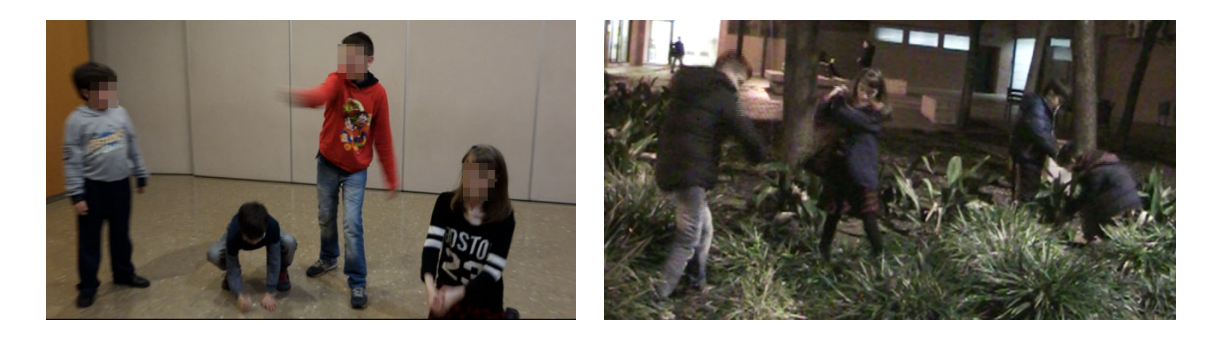
Figure 4: Left: The students performed the concept of a magical garden. Therefore, they enacted different actions such as hoeing, harvesting, and watering in the workshop room, and Right: repeated their performance in the physical location that represented their core idea of the narrative.

Building on our experiences in this project, we recommend employing playful design techniques that engage children in bodystorming activities and allow them to reflect upon their body sensations and relationships between proxemics.