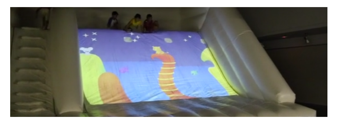
Figure. 09: The FUBILE Archimedes using the Interactive Slide.

In this design stage, we propose using research methods and elicitation techniques that allow (1) co-designers to understand children's worldviews, and (2) triangulating the outcomes using different techniques to confirm co-designers' interpretations of children's behaviours with a prototype. For understanding embodied meaning-making in FUBILEs we employed a Multimodal methodological approach to analyse children's in situ interaction with the project Archimedes (Malinverni et al., 2016a), a FUBILE based on the Interactive Slide platform (Soler-Adillon, 2009). The Interactive Slide is an exergame platform based on a large inflatable slide augmented with digital technology (Figure 9). Four main parts compose the interface: a sliding surface where the digital content is projected, an upper part where the children can stand before sliding down, a bottom part where the children land after sliding, and the lateral stairs. The Interactive Slide allows a natural and playful interaction as children interact with the digital content by moving through and across the sliding surface, where the interactive content is projected.