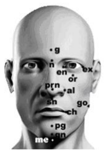
Figure 1. Anthropometric soft-tissue landmarks: g-glabella, n-nasion, en-endocanthion, ex-exocanthion, or-orbital, prn-pronasal, sn-subnasal, al-alae, ch-cheilion, pg-pogonion, gn-gnathion, go-gonion, me-menton (Calignano, 2009).

One of the most important application that deal with facial landmarks is face recognition , whose large applications are: citizenship identification in borders, passports, I.D. documents, Visas; criminal identification in database screening, surveillance, alert, mob control and anti-terrorism; corporate usages in access control and time attendance in luxurious buildings, sensitive offices, airports, pharmaceutical factories; utility laptop, desktop, web, airport/sensitive console log-on and file encrypt; on line banking; gaming in casinos and watch-lists; hospitality industries such as hotel and resort CRM's; important sites like power plants and military installations. The purposes are various, but belong to two big branches: face verification, or authentication, to guarantee secure access, and face identification, or recognition of suspects, dangerous individuals and public enemies by Police, FBI and other safety organizations (Jain et al. , 2005).