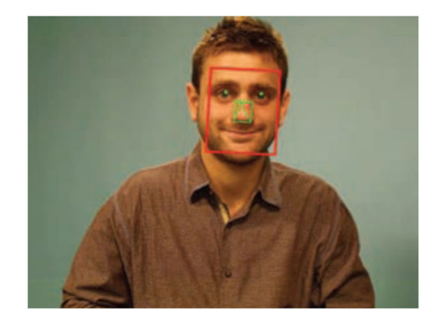
Figure 3. CSIRO Head Pose Tracking [20]