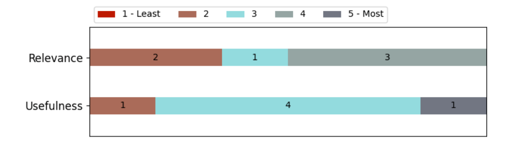
Figure 5: Reported relevance and usefulness of QueryQuestions-SE model.

tions could be useful in improving search, all of them agreed that this is a good mechanism. Specifically, P4 found the experience of our plugin helpful in this regard, stating "From my experience in using this plugin, I found clarification questions useful." P2 and P5 also mentioned that adding terms to queries using clarification questions is a good idea, while P3 pointed out that clarification questions could help to narrow down the search results and provide more direction to generic search queries.