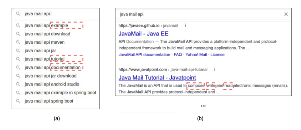
Figure 2: (a) Google suggestions for the query - 'java mail api', (b) top Google results for the query 'java mail api'. Using the information in (a) and (b) the annotators identified the facets: 1) 'read', 'compose', 'write'; 2) 'example', 'documentation', 'tutorial' etc.

retrieved results. Sometimes search engine results for the queries included very specific terms that cannot be grouped into facets. For example, for the query, 'add java to path', the path - /home/user/path/to/env - is too specific to belong in a facet, and, for the query, 'java indexof method' - the method signature - indexOf(String str, int start) - is too specific. In Figure 2, we provide a screenshot of top results provided by Google and a retrieved top page for the query 'java mail api'. Here, one possible facet included actions such as 'compose', 'write', and 'read'.