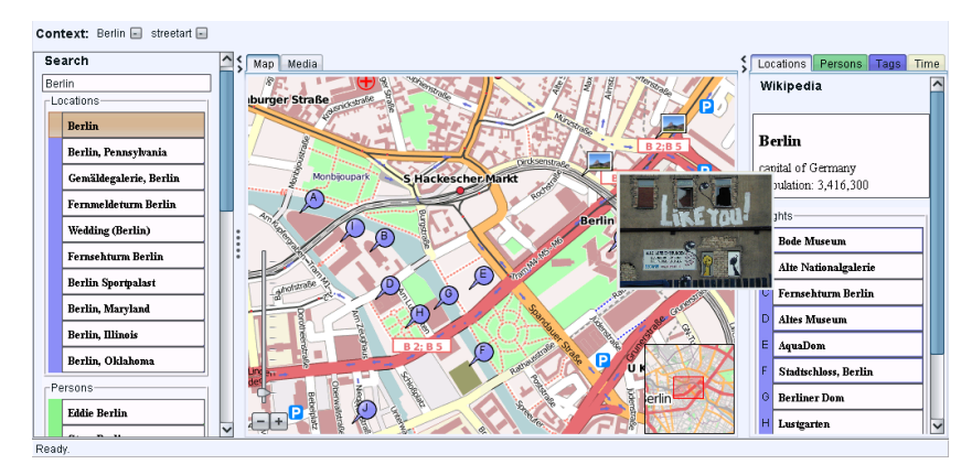
Fig. 1. Screenshot of the SemaPlorer application showing street art in Berlin

in SemaPlorer, namely location, time, people, and tags. Other facets can be easily configured and added. A facet provides a filtering on a large data set. For example, SemaPlorer can present the sights of a certain city or area using the location facet. Blended browsing and querying means that while users interact with SemaPlorer, different queries are constructed in the background and forwarded to the underlying storage infrastructure and their results are visualized on the screen. This approach allows for a user-driven visualization and interactive experience of the semantic data provided on the Web today. In SemaPlorer, the users initially state a simple text query to the system as depicted in the top left corner of Fig. 1. The result list contains different places, people, and tags matching the query. When the user clicks on the city of Berlin, the SemaPlorer application updates the center part of Fig. 1 showing a map of the city. Concurrently, a query is executed filling the map view with interesting places and sights, represented by pins. At the same time, a second query is executed based on what is currently seen on the map to fill the context view in the right hand side of Fig. 1.