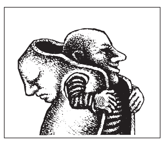
Figure 1: Change of era: The direction is changed dramatically and the history of our motion is like a hood behind our shoulders. To describe our recent direction we need to understand our past. Graphics by Mikhail Molibog.

The face of science has changed (see cartoon in Fig. 1). Surprisingly, when we start asking about the essence of these changes and then critically analyze the answers, the result are mostly discouraging. Why do we talk about complexity? Somebody might answer that now we have to study non-linear systems and therefore they are complex. The answer seems to be plausible, nonlinearity results in non-additivity of parts and in the emergence of new phenomena: "The whole is more than the sum of its parts." But objection appears immediately: non-linearity has been in the focus of scientific research already for more than a century. Poincaré and Lyapunov have studied nonlinear systems more than a century ago. Boltzmann's equation and Navier–Stokes equation, the great nonlinear equations are more than a century old. Many ideas have been created and many methods developed. The study of non-linearity is not a symptom of the change of era. More than a thousand years ago Aristotle had written that "the whole is something besides the parts" (Metaphysics, Book 8, Chapter 6) and the Western culture had accepted this idea from the very beginning. By the way, 'besides' in this translation of Aristotle sounds much more precise than the widely spread 'more'.