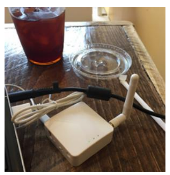
Figure 2. P26's mobile firewall/VPN device.

Personal and organizational preferences also reinforce the privacy of mobile work performed across various locales. P37 (a clinical research associate) noted: "I told my boss I would be probably working in a coffee shop and she was like, 'oh, you should probably get a privacy screen and it's a requirement of the company,' but I think a lot of people don't have them."