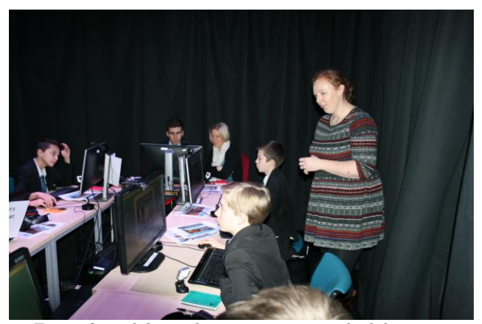
Fig. 3. One of the evaluation sessions in the laboratory

Four REVERIE researchers were present in the lab to record each session and to provide the necessary support (technical and logistical) for the successful completion of each session.