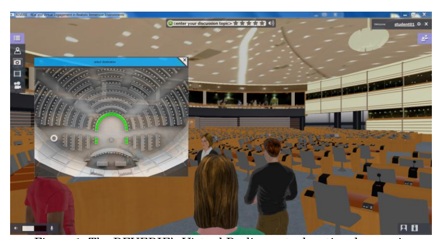
Figure 1: The REVERIE's Virtual Parliament educational scenario

We used the REVERIE framework (Fechteler et al., 2013) to implement an educational scenario which immersed participants in a guided tour of the virtual European Union (EU) parliament followed by an online debate session. In this role-playing scenario participants (in the role of teachers or students) interacted with each other and an Embodied Conversational Agent (ECA) to complete educational tasks designed to promote dialogic learning (Hajhosseiny, 2012).