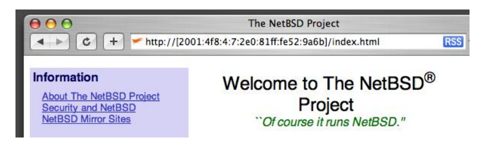
Figure 5: Using IPv6 addresses in the URL

In most cases, using normal Internet clients over IPv6 will not appear any different. For example, figure 4 shows a browser connected to a website over IPv6 with no noticeable difference (except for the displayed IPv6 address in sent back from the website). It is still possible to use IPv6 addresses directly with many tools. For example, the browser in figure 5 is connected using an IPv6 address (note the address enclosed in square brackets). Not all graphical tools work this seamlessly. For example, Apple's "Network Utility" does not fully support IPv6 with some of it's features<sup>13</sup>. (Figure 5)