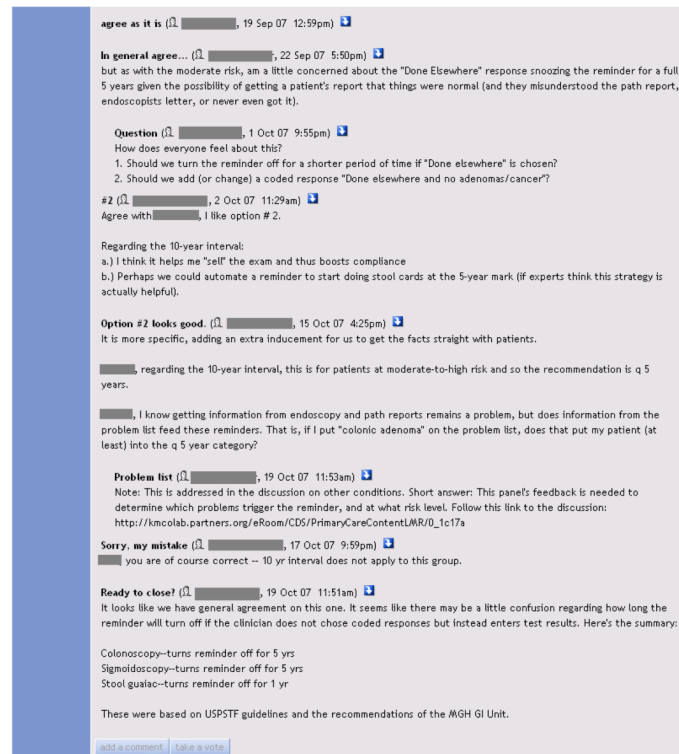
Figure 3. Example of an online, guided discussion in Partners' eRoom (Note: Clinician identifying information has been obscured for privacy.)