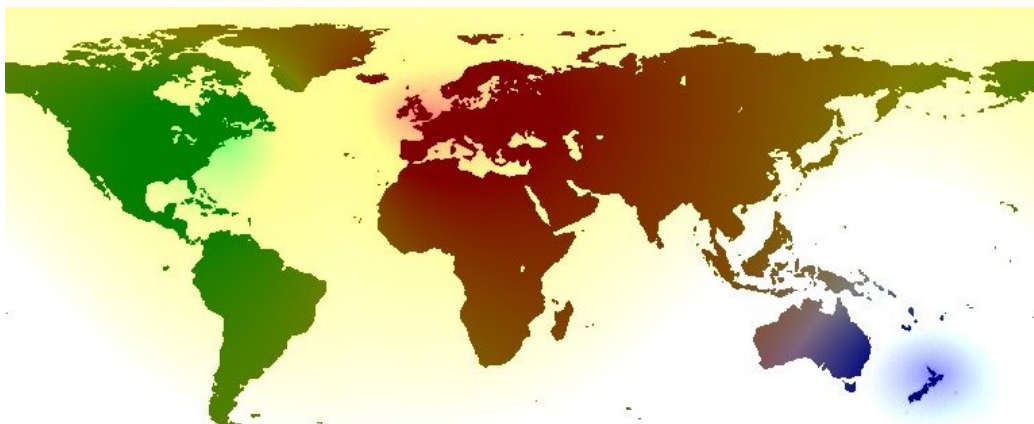
Figure 4: Map of the world showing when someone refers to “Cambridge,” which location they are most likely to mean dependant on where they are. If the person is in a green part of the world, they probably mean Cambridge Massachusetts, red is Cambridge, UK and blue, Cambridge New Zealand. This map is based on the best performing function with variables optimised for English speakers: \text{rel}(l, p) = \text{dist}(p, l)^{-0.72} \cdot \text{pop}(l)^{0.44} .

confusion and increase the shared understanding of the world required for any dialogue.