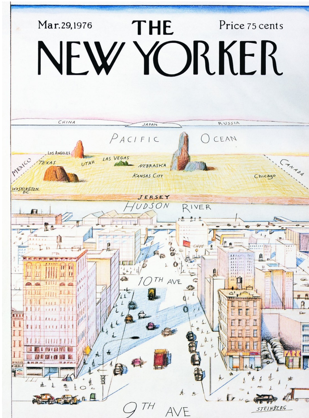
Figure 1: Cover of The New Yorker from March 29, 1976.