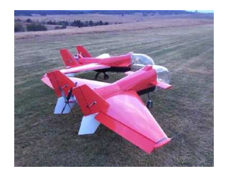
(a) Brumbies in Field