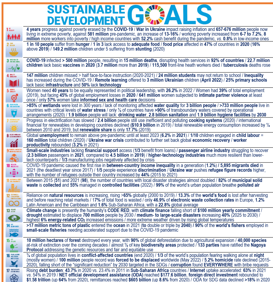
Figure 2. Sustainable Development Goals achievement progression estimation, according to the latest data from the United Nations (2022)