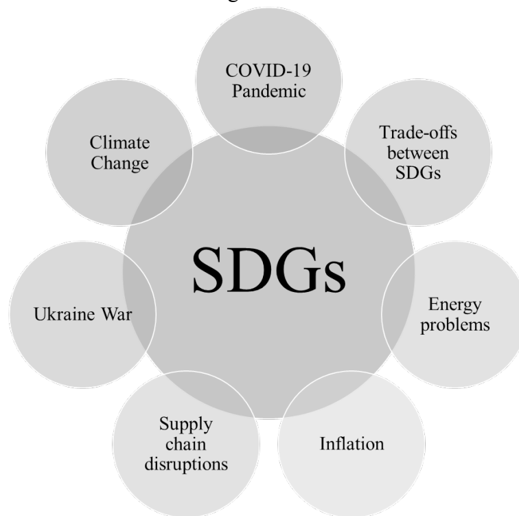
Figure 1. Some of the factors interfering with the SDGs.

In this sense, the trade-offs and synergies that exist between the SDGs can be explored by policymakers and decision-makers in the efforts towards economic growth that also take into consideration the environmental and social impacts generated (Fonseca et al., 2020; Gasper, 2019).