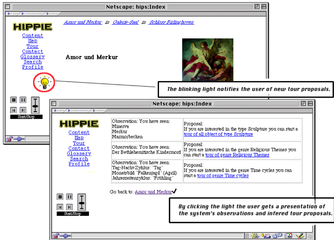
Figure 3: Notification of an adaptive tour proposal