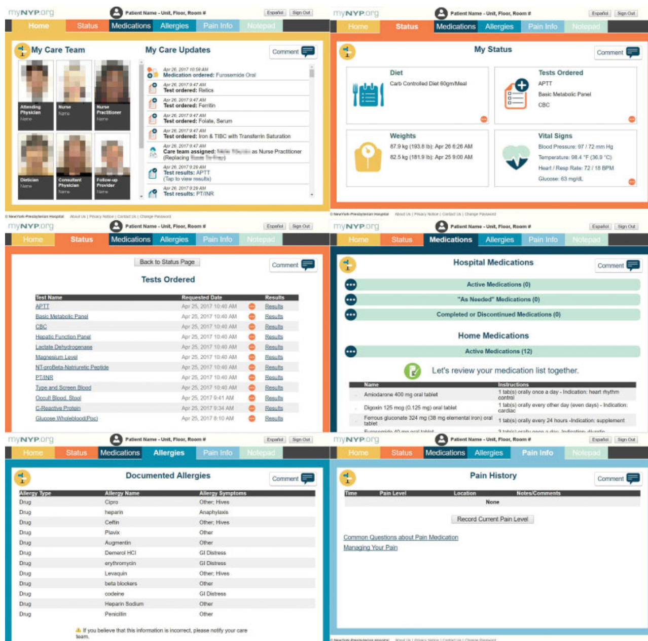
Fig. 1 Screenshots of the inpatient portal.