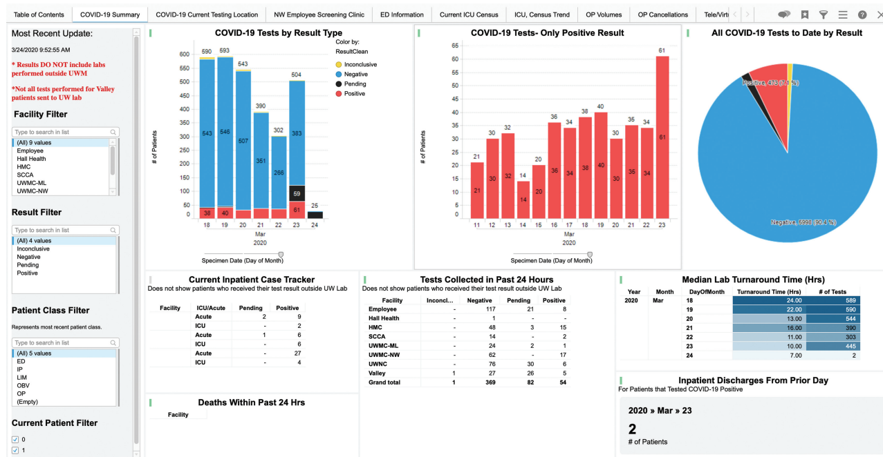
Fig. 2 COVID-19 incident command dashboard. UW Medicine IT services created a dashboard for our COVID-19 hospital incident command. A list of metrics collected can be found in ► Table 1 .