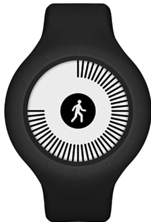
Fig. 2 Withings go activity tracker.

research assistant. As the avatar climbs the heart mountain, each step triggers information, problem-solving challenge (e.g., quizzes), mini-game (word puzzle or slot game), or bonus wheel spin for extra points (→ Fig. 3).