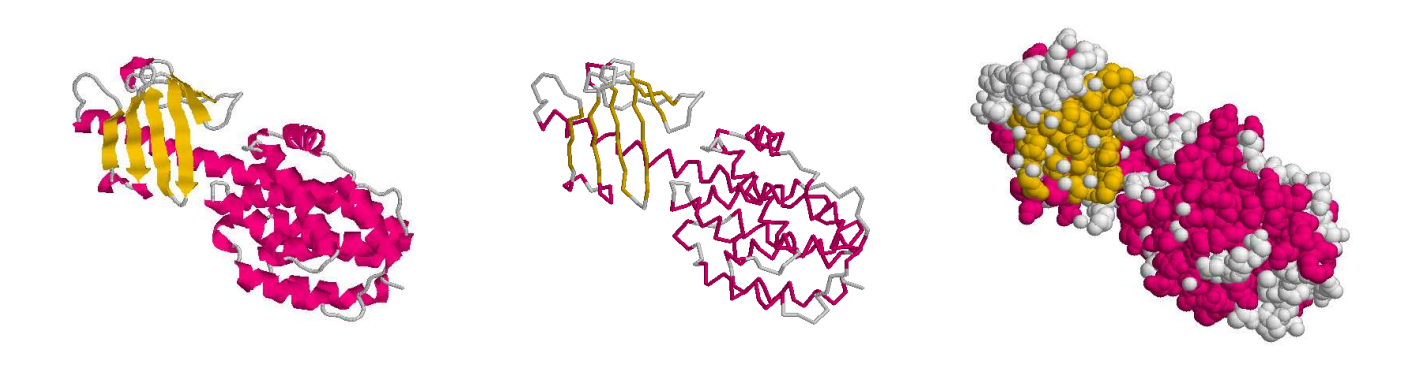
Figure 1. Example of the three dimensional model for the protein structure with pdbid 1CIS. All images are produced using RasMol http://www.umass.edu/microbio/rasmol/. On the left: cartoon display, one can easily recognize the second-order structure. In the middle: the C_{\alpha} -backbone of the protein. On the right: All atoms are displayed using small spheres.

normal distributions. We will explain the protein structure model in more detail in section 4. However, for a better understanding of the invariant feature construction, we will think of \mathbf{x} as the intensity function for a three dimensional object at first.