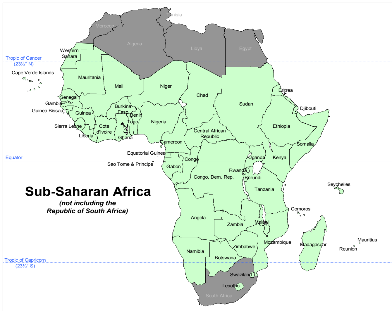
Figure 1. Map of Africa Sub-Saharan Africa is south of the Tropic of Cancer (23½° N)