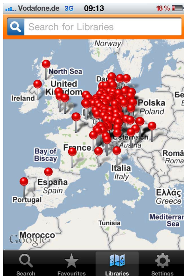
Img.2: Choose a library by clicking on a needle.

On the library info-card users have the option to set a home library in order to get accessibility information for their library. Actual rights may of course differ depending on the real location and access rights of the user. Also, this information is usually only available for German libraries.