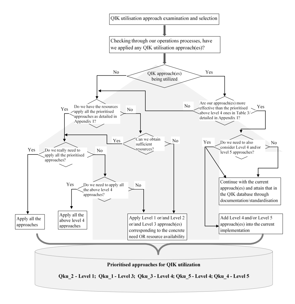
Figure 3. Framework for selection of QIK utilization approach(es) for implementation

To operationalise the selection process of the QIK utilisation approaches for the convenience of MEs in their KM practice for operations excellence, a framework based on the research findings has been developed as illustrated by Figure 3, for guiding the QIK utilization approaches' implementation step-wise.