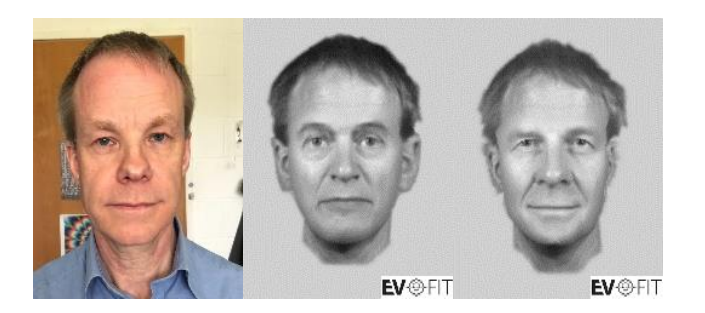
Fig. 1. Example target and composites from Experiment 1, left from a participant using EvoFIT Online and right from a participant using Witness At Home. These two composites were named at 75% and 92% correct, respectively.

b) Witness At Home Construction Stage: Participants worked online to construct the face: they initially viewed an instructional video and then completed face construction on their own. Procedures were equivalent to the EvoFIT Online procedure in terms of selecting the face database, smooth and textured faces, using holistic and shape tools, and adding external features. The researcher remained on hand to answer any questions a witness might have; in all cases questions were limited to procedural (e.g. should I press the 'next' button) rather than featural issues (e.g. do you think the nose is big enough). See Fig.1 for example composites produced in experiment 1.