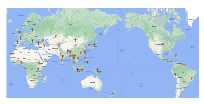
Fig. 1. Geographical distribution of the New Language track submissions. The 45 languages are marked on a map with their rough locations of speaking.

to offer a comprehensive description of their submitted data and to execute experiments utilizing established models from the ML-SUPERB benchmark.