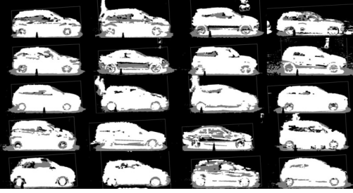
Figure 2: Examples of the normalised RGB and foreground mask composing the vehicle dataset.