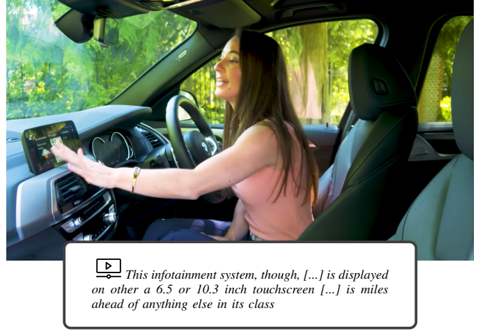
Fig. 2: Frame from MuSe-CaR (video id 2, 4:06) showing a User Experience segment and corresponding transcripts.

a) MuSe-CaR: The MuSe-CaR [6] is a multimodal dataset gathered in-the-wild from English YouTube videos centred around car reviews. It was created with different computational tasks in mind, allowing researchers to improve the machine’s understanding of how sentiment and topics are connected. The in-the-wild aspect of MuSe-CaR refers to the natural conditions a video is captured in. It varies in recording equipment, recording setting, and soundscapes. The audio captures ambient noises (e.g., car noises), while the