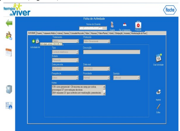
Figure 1. Telenursing support system

The development of this support system had an endpoint - the psychological well-being of cancer patients (Figure 1).