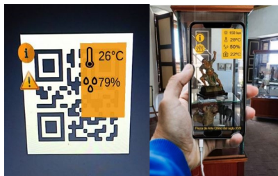
Fig. 3. AR App Testing and Proposal

information it will be possible to use two available ways, the university platform via web and an AR application developed using the Vuforia SDK due to the features it provides, the greater number of compatible devices it supports and the improvements it has presented in recent years with respect to the competition. Each display case will have a QR code that, when scanned by the application, will allow the specialist to access in real time to the information of the environmental variables for each display case, as well as to obtain alerts on the system if necessary, as shown in the Figures. All the information will be available both remotely and inside the museum, since the information will be replicated on the Universidad de Oriente platform and on the museum's main hub. The tests carried out with the AR application and the proposed final result are shown in Figure 3.