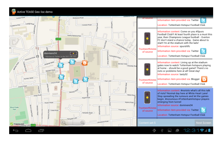
Fig. 4. Map-based application used within experiments; this presents CS5. To the left, a map with geo-tagged information items is shown, and to the right, the respective information content and associated trustworthiness levels are portrayed in a list format. Users of the application can tap items on the map and have the related content automatically selected in the list on the right.

Grounded in the experiment design, a map-based tablet application was developed. Figure 4 displays a screenshot of the application and an example of the scenes presented to participants.