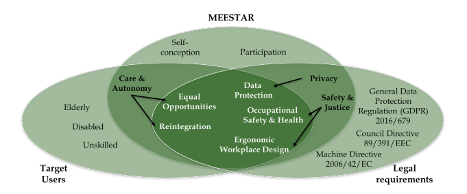
Fig. 2. The intersection of ethical, legal and social implications (ELSI) define the requirements for the considered inclusive human-machine system.

justice, privacy, participation and self-conception. The y-axis describes stages of ethical evaluation, allocating problems among four levels of ethical sensitivity. The z-axis provides three points of view (individual, organizational, social).