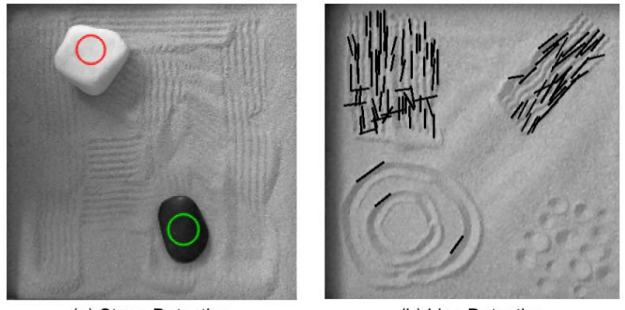
(a) Stone Detection

Regarding the stones, properties such as size, color and location are detected through blob detection methods. The analysis of the sand patterns is based on two aspects: lines and curvatures. The program detects the amount of lines and curvatures using the Hough Transform (see Fig. 3b for lines), which represents the hardness and softness of the shapes.