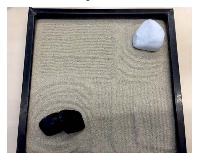
Fig. 1. Miniature Zen Garden used for our SoZen system.

Sound is a powerful carrier of contextual information and – as subconsciously processed soundscape – also affects the listeners mood and mental state [1]. However, we rarely attend to or design our soundscapes, and mainly focus interior design on visual artifacts. Sound is often merely considered as selecting music, and the interfaces for that are often explicit, cognitive, attention-absorbing and rigid. This gives rise to the search for alternative means to give inhabitants ways to shape or refine the room's soundscape.