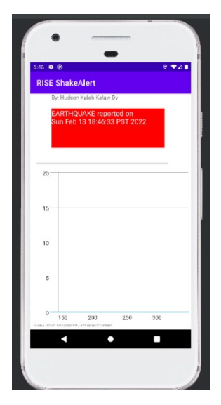
Figure 4: Screenshot of another device showing no shaking detected locally, but an Earthquake warning was received from the server which is shown on screen. An audible alarm is also triggered on every device.

Figure 3: Moderate shaking detected by device which are reported to the server. This is a screenshot after the shaking report was sent to the server and the earthquake warning received back from the server. An audible alarm is also triggered on every device.