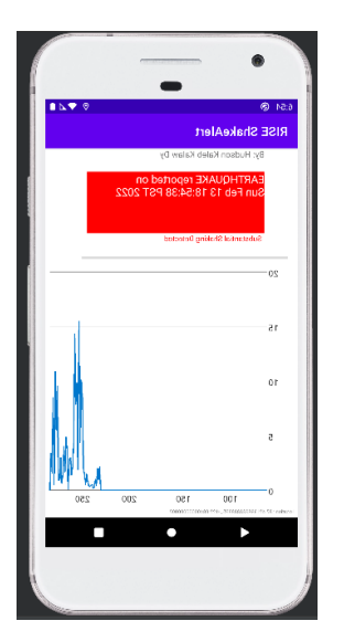
Figure 5: Extreme shaking detected locally and sent to the server. This is a screenshot after the shaking report was sent to the server and the earthquake warning received back from the server. An audible alarm is also triggered on every device.