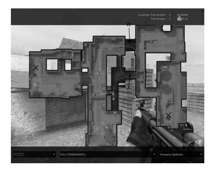
Figure 1. Game Map

through which terrorist needs to pass through to reach the bomb sites and counter-terrorist having the knowledge of these positions would plan to defend at these places. There are many other such 'critical positions' on the map, for example bomb sites.