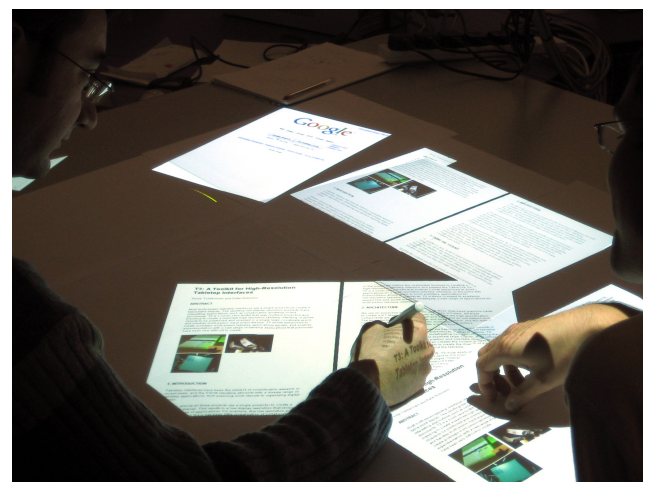
(a) Collaborative web-browsing and document review applications.

My research investigates the problem geographically-separated colleagues consider two co-authors of a paper, review each other's draft contribution