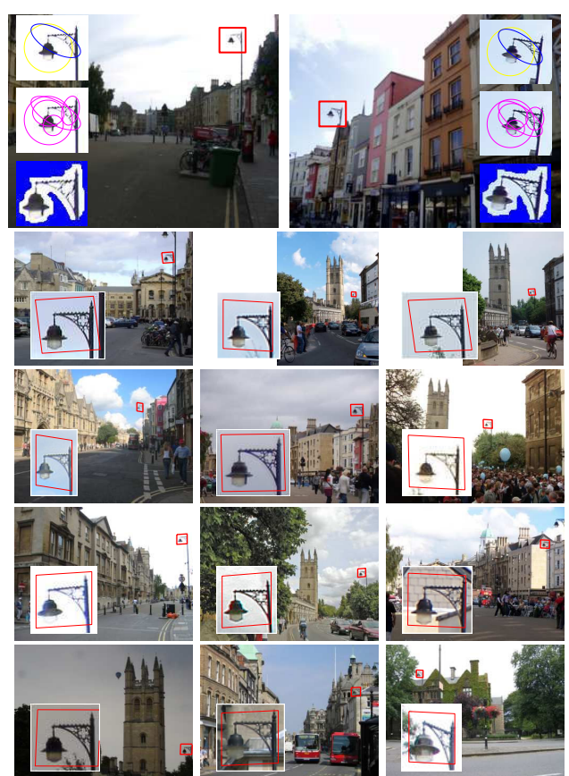
Figure 1. An automatically discovered object in an unordered collection of 100k images. The lamp is visible in approximately 0.014% of the images and it covers on average about 0.28% of pixels of those images. Top: the 'seed' image pair found by the Geometric min-Hash. The three close-ups show the colliding sketch, its geometric support and the co-segmentations, respectively. Bottom: other detections (with close-ups) obtained by object retrieval using the seed pair. Note that all bounding boxes are discovered, not drawn by the user.

The min-Hash describes images by selecting independently visual words as global descriptors, with the property