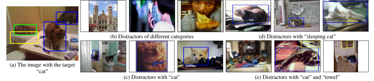
Figure 1: An example from the new Cops-Ref dataset for compositional referring expression comprehension. The task requires a model to identify a target object described by a compositional referring expression from a set of images including not only the target image but also some other images with varying distracting factors as well. The target/related/distracting regions are marked by green/yellow/blue boxes, respectively. More details about the reasoning tree can be seen in Sec. 3.1.

Expression : The cat on the left that is sleeping and resting on the white towel.